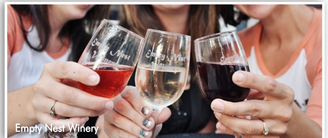
Empty Nest Winery