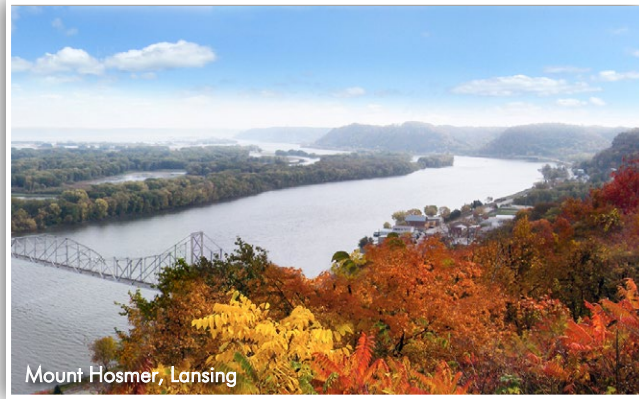
Mount Hosmer, Lansing

This tear sheet was created to help you navigate the Driftless Area Scenic Byway. We hope the following detailed information below about points of interest & services will assist you in your driving experience!