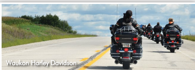
Waukon Harley Davidson